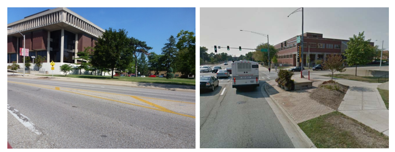
Original proposed location just West of College and School Streets. North side of College, west of School.